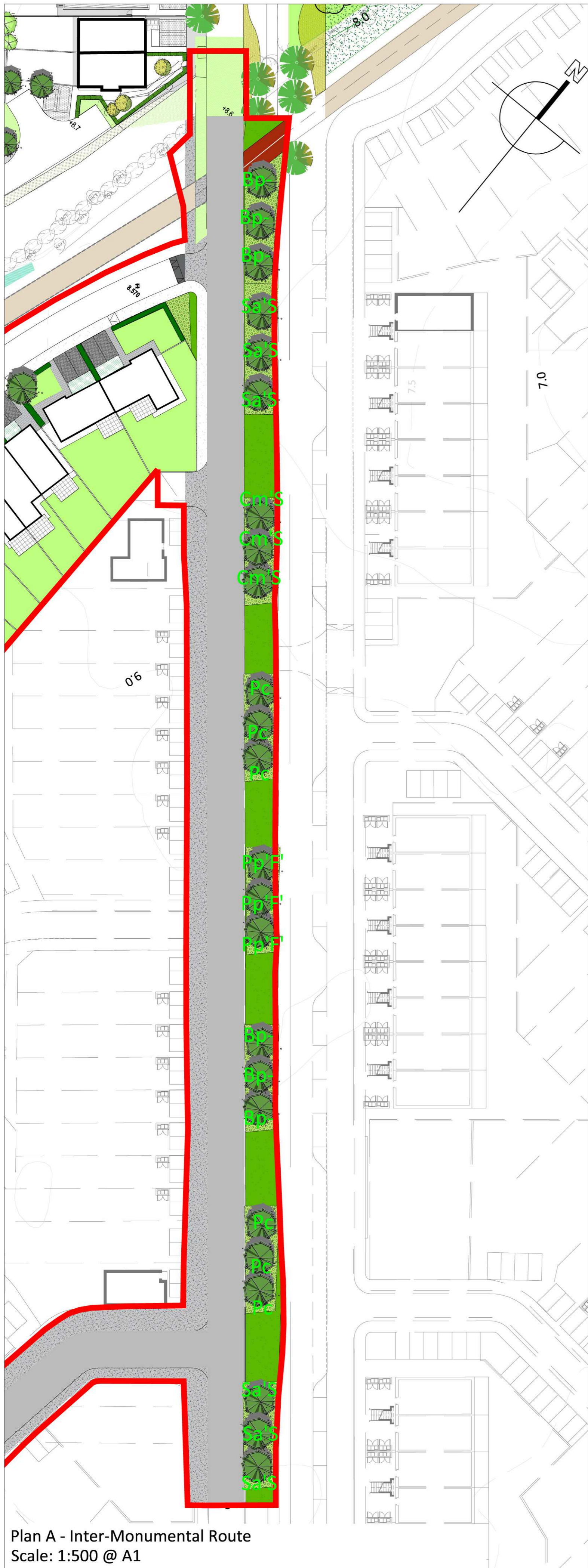
Plan A - Inter-Monumental Route Scale: 1:500 @ A1