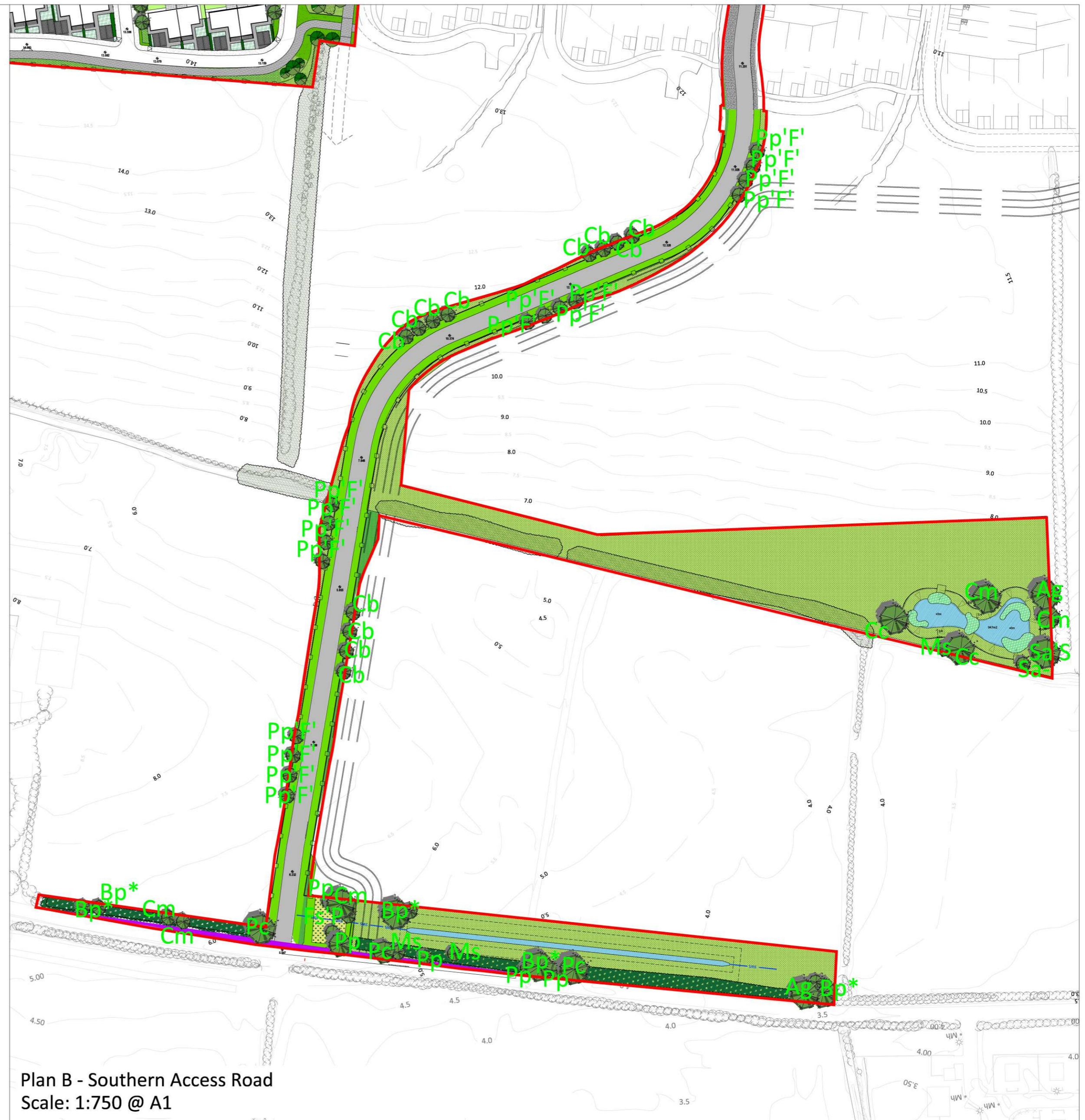
Plan B - Southern Access Road Scale: 1:750 @ A1