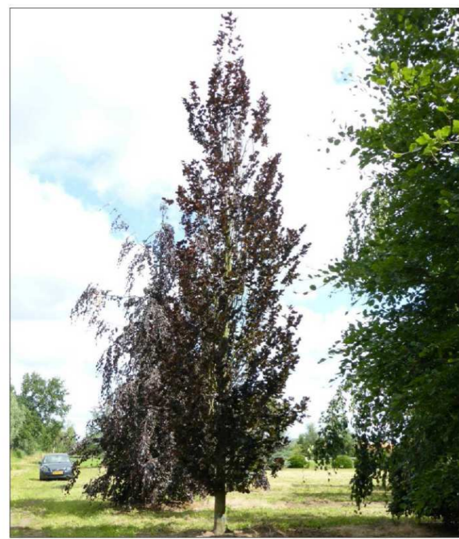
Fagus sylvatica 'Dawyck Purple'